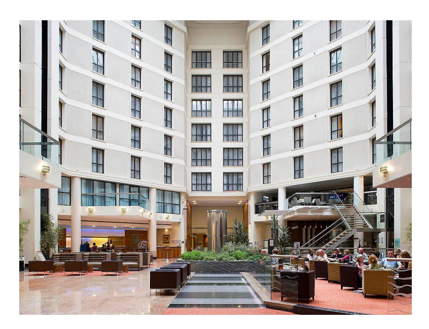
Sofitel London Gatwick | North Terminal | London Gatwick Airport | Crawley | West Sussex | RH6 0PH

Rooms can either be booked online (www.sofitelgatwick.com), or by telephoning the hotel on 01293 555155.